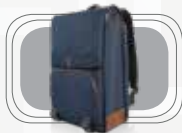
Lenovo 15.6" Laptop Urban Backpack B810