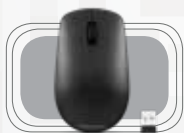
Lenovo 400 Wireless Mouse